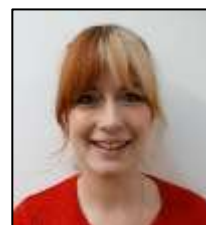
Miss West Newt Class